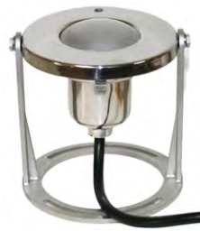
Small, Stamped Stainless Steel With Base Option, No Guard