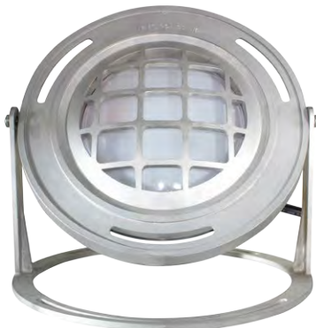
Large, Stamped Stainless Steel With Guard and Base Options