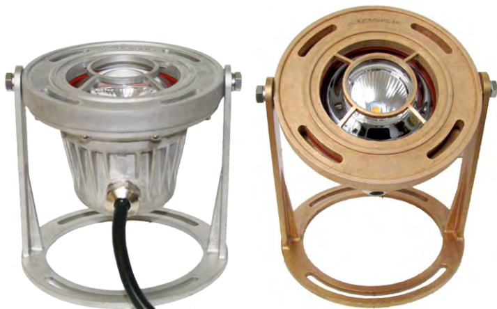
Cast Stainless Steel With Base Option