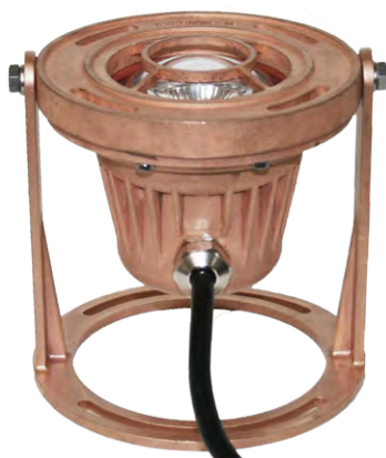
Cast Bronze With Base Option