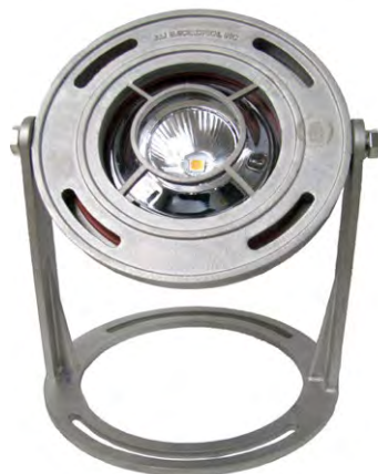
Cast Stainless Steel With Base Option